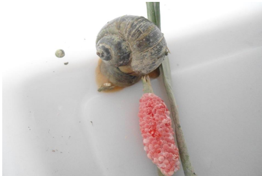
Picture 1. Specimen of Pomacea canaliculata and eggs clutch