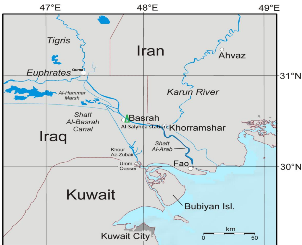
Figure (1). Map of the study sites near Al-Salyheh canal.